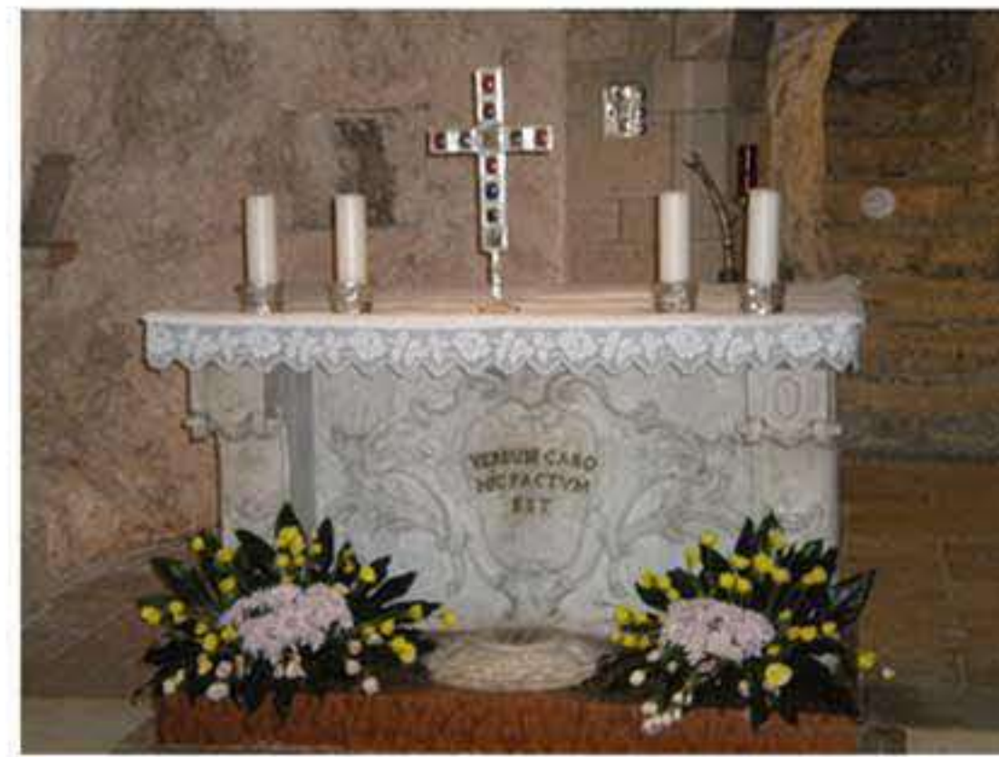
Grotto of the Annunciation