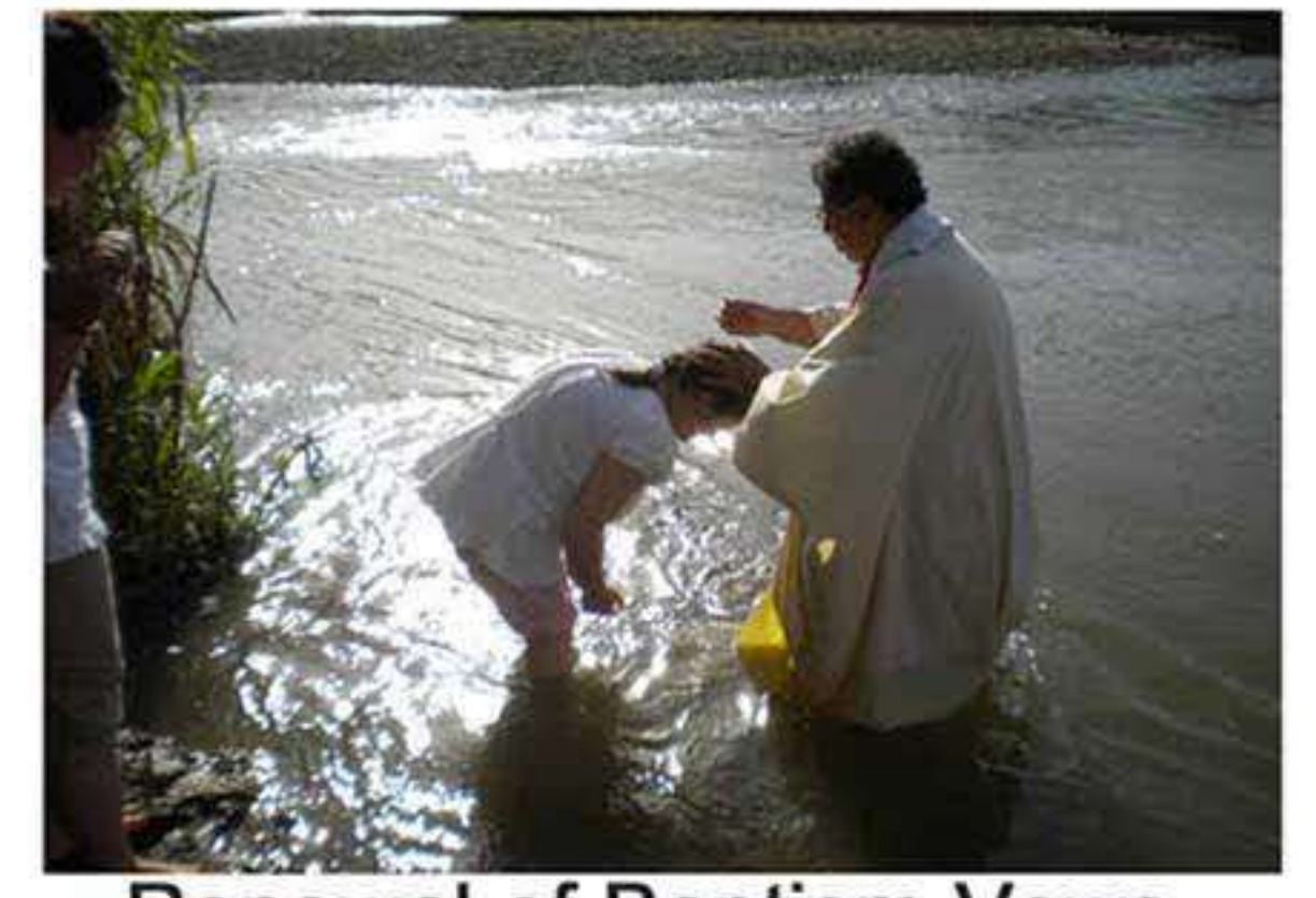
Renewal of Baptism Vows in the Jordan