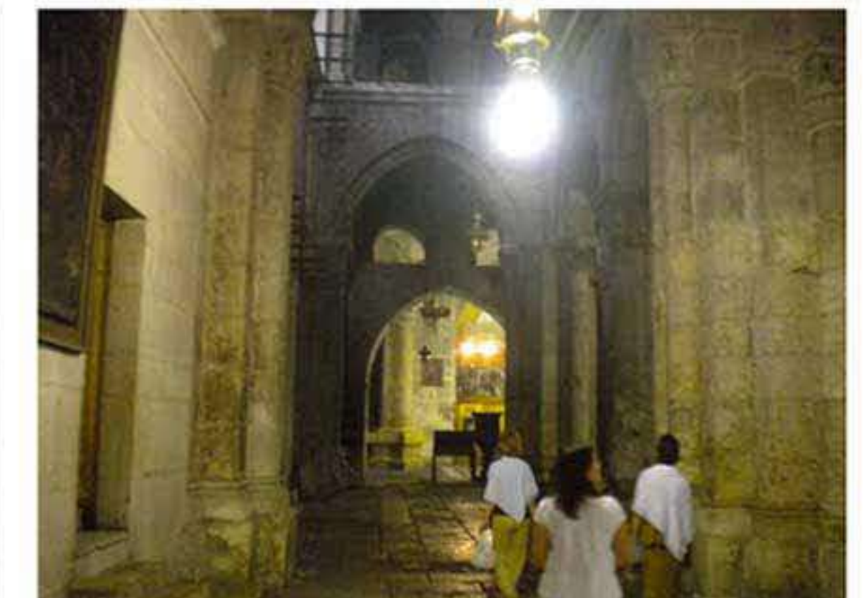
Church of the Holy Sepulchre