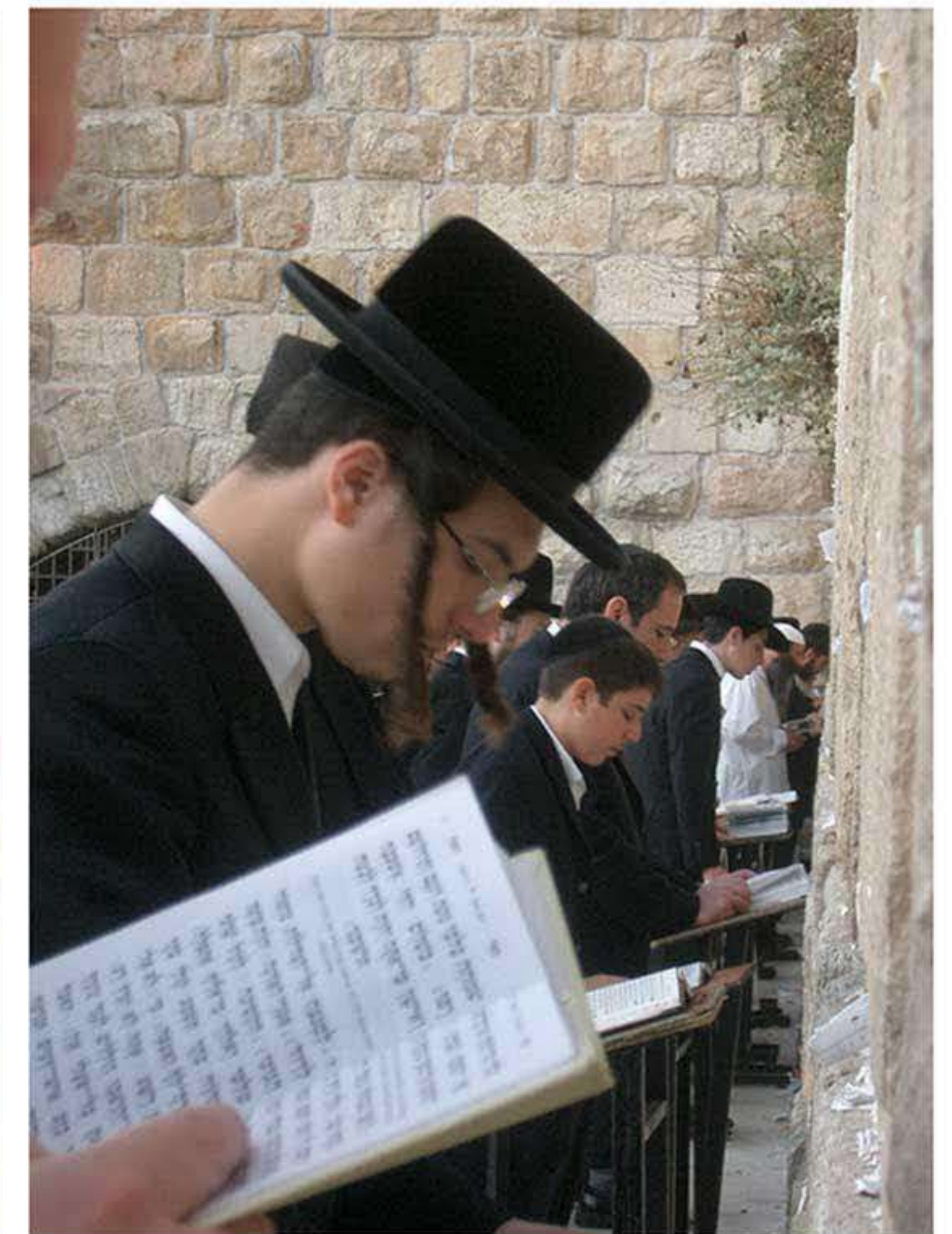
Praying at Western Wall