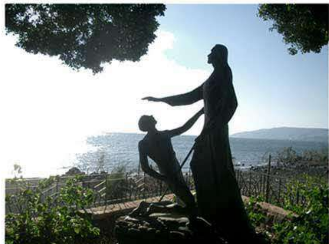
Where Jesus asked Peter "Do You Love Me?"