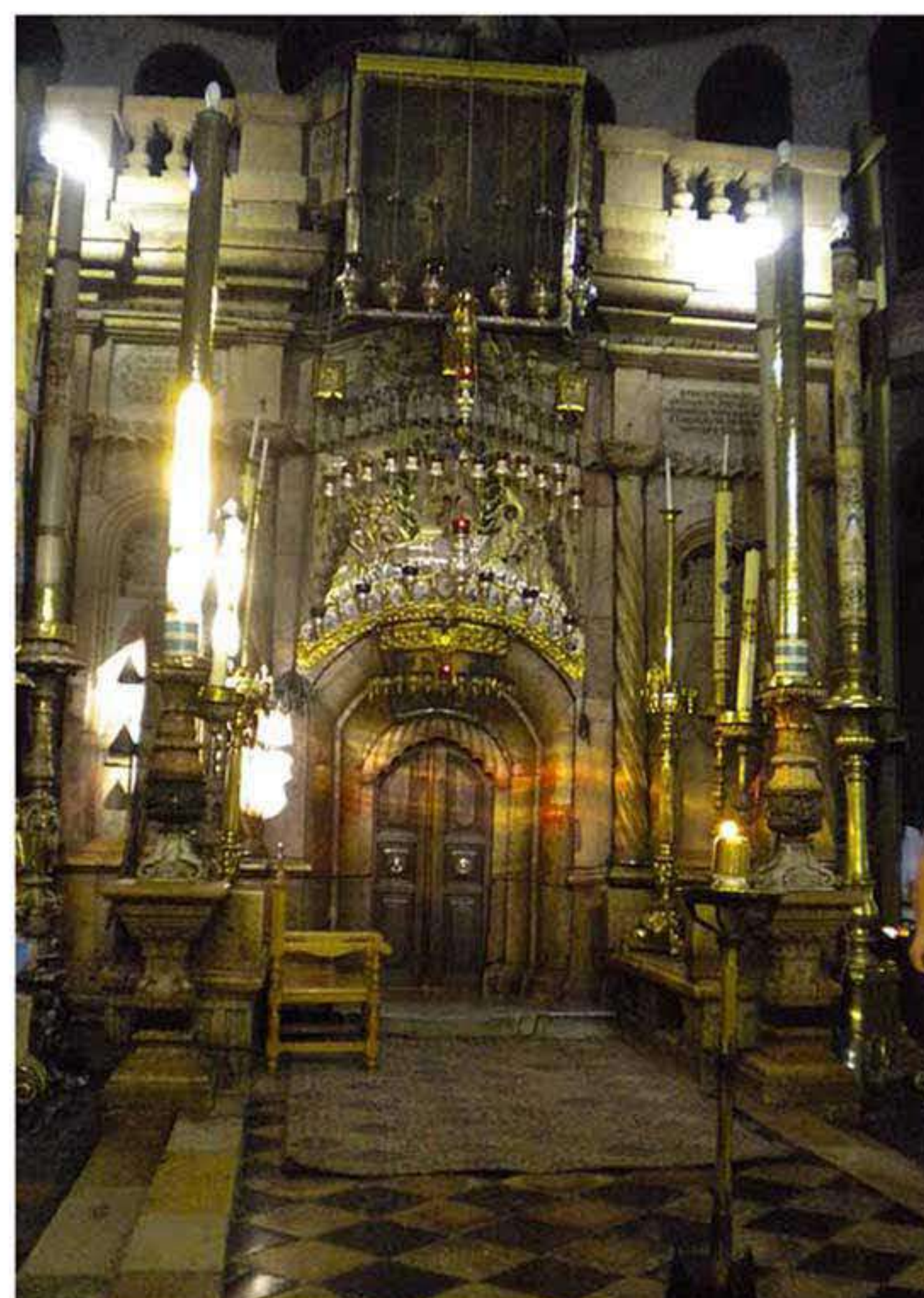
Church of the Holy Sepulchre