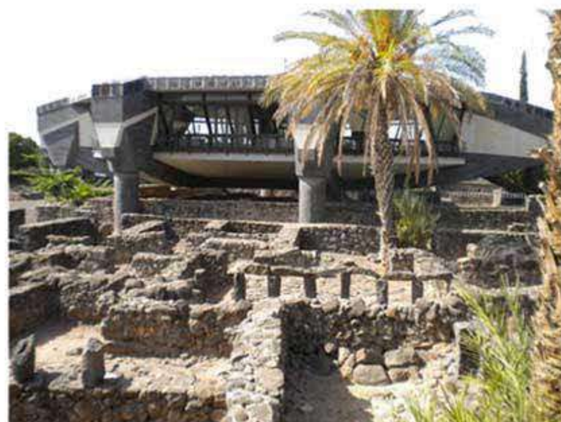
St. Peter's House in Capernaum