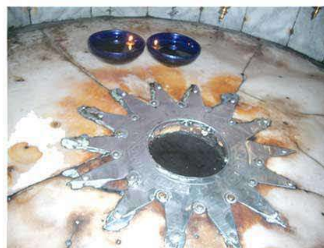
Spot of Jesus' Birth