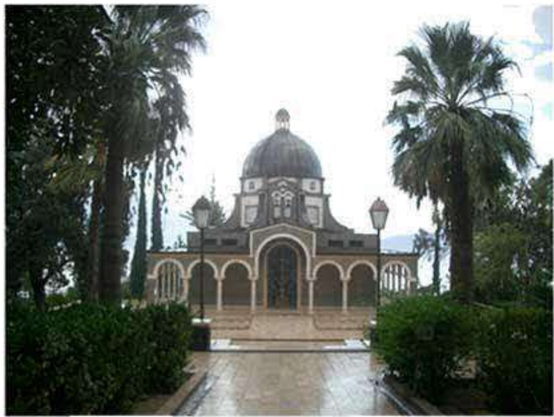
the Mount of Beatitudes