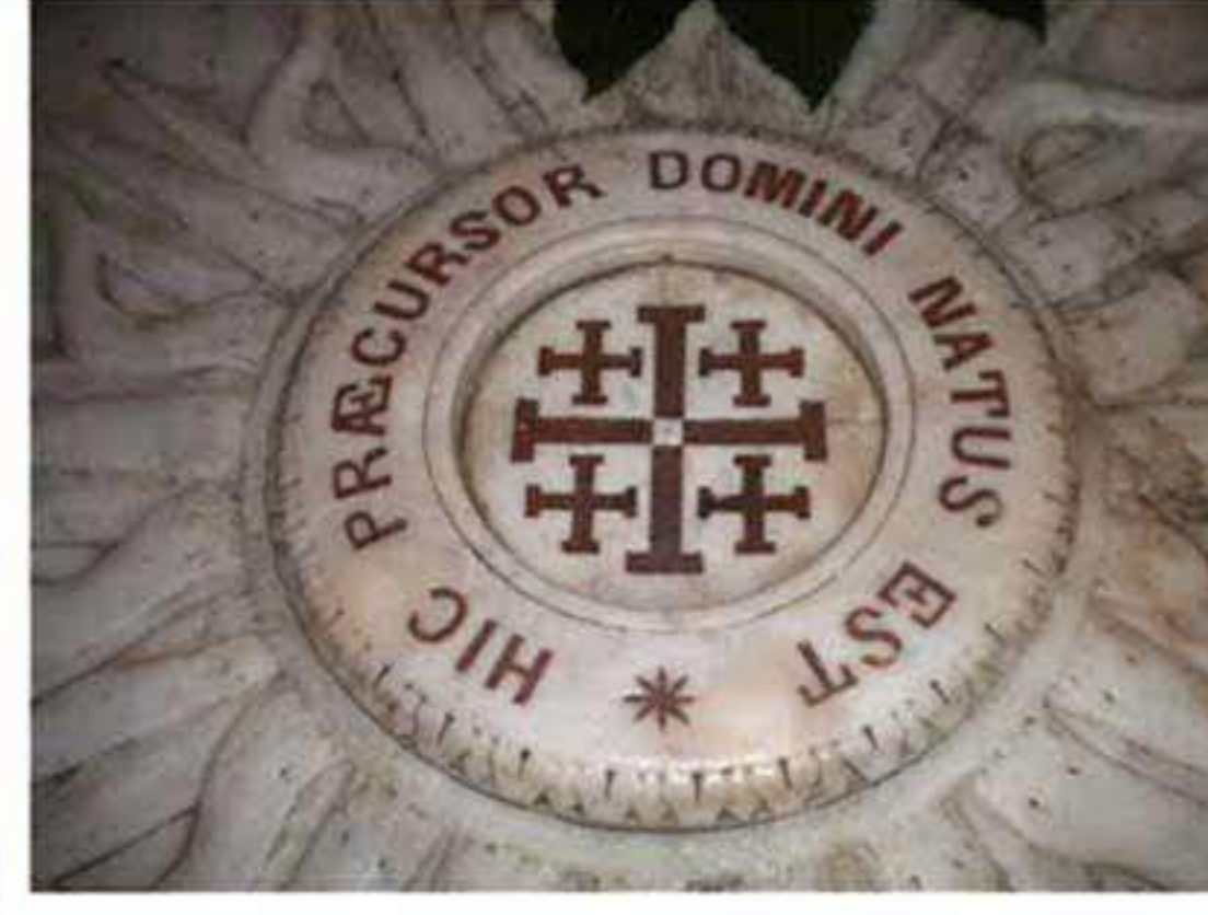
Spot where John the Baptist was born