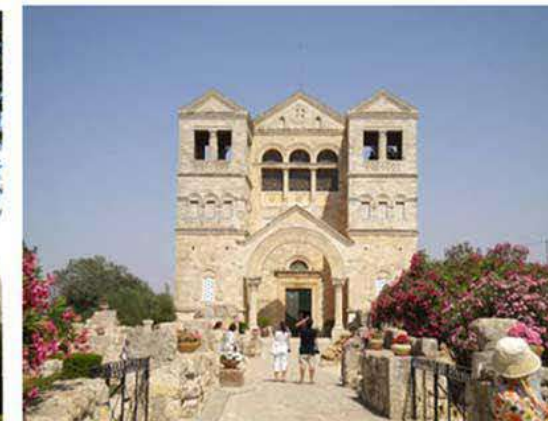
On Top of Mount Tabor