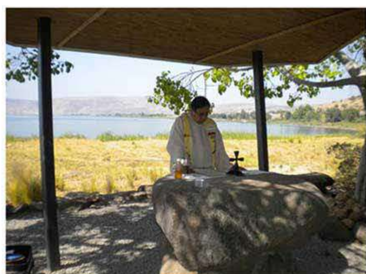
Mass on Shore of the Sea of Galilee (Tabgha)